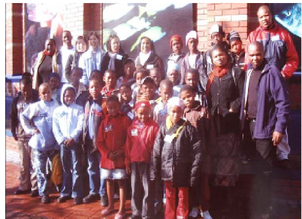
Photo of child programme in Khayelitsha

14 and those who are deemed most at risk. Four days a week at all of our centres, the child programme coordinator as well as programme volunteers visit the children and engage in several activities that benefit their health and well being. The general activities include an introduction to health and self through drama whereby children are oriented to the purpose of participation. While at the centres, the children's health is monitored and recorded. If any concerns arise, children are subsequently referred to the correct health facilities. Through the creation of a positive and interactive environment, children learn to trust the support group and thus attend and participate on a regular basis to achieve its optimal benefits. Children are also engaged in active play and education where they receive and retain information on how to lead healthy lifestyles, such as how to properly wash their hands and brush their teeth. The programme additionally distributes nutritious food to the children on a bi-weekly basis and monitors the progress and development of each participant.